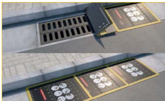
Suitable for grate of large size drains. Seal the entrances even if they are overlapped.