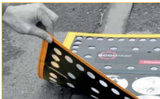
Very easy to install.