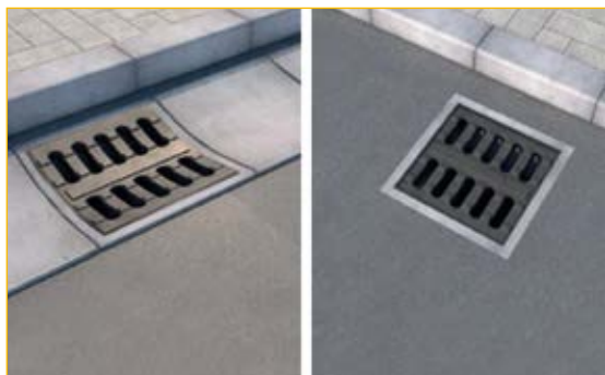
Suitable for all canalization and drainage systems, also for curved manholes.