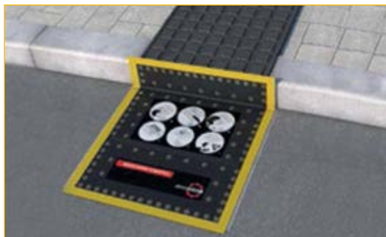
For manholes and grates with "mouth" on the sidewalks as shown in picture.

Universal modular system for fast secure manholes and sewer grates in the event of dangerous liquid spills, flammable or toxic substances. It can also be used in manholes with angled drains.