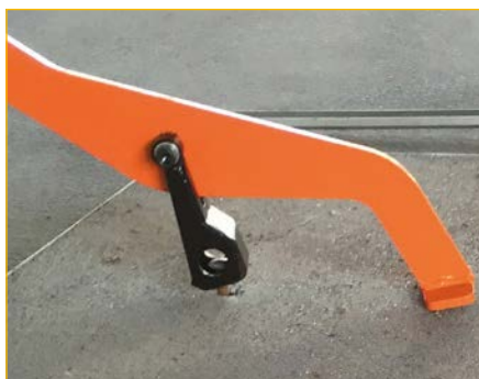
Possibility to custom hooks according to specifications if needed.