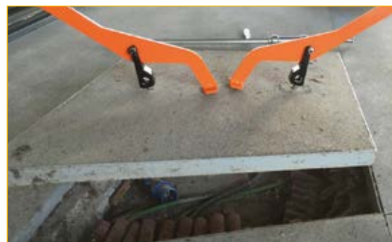
Opening larger lid can be done with two LB2.