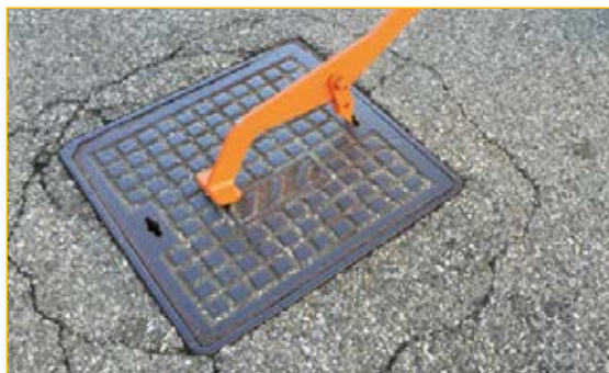
Inserting the hook into the slot and rotate to 90°.

Practical lever lifter for lids with latches or in the absence of cast iron surface. For the correct connection the lower hook is inserted into the slots on the cover and the lever is turned through 90°.