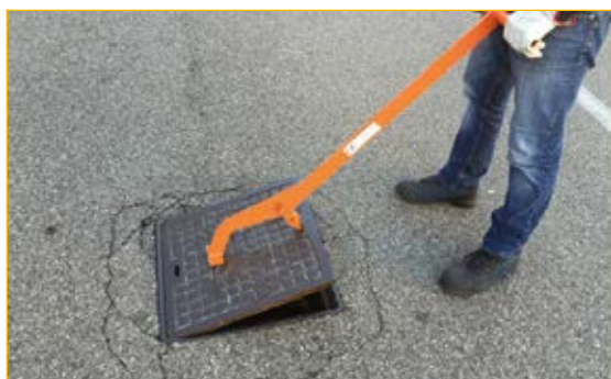
In the opening operation, the length of the lever limits the operator effort.